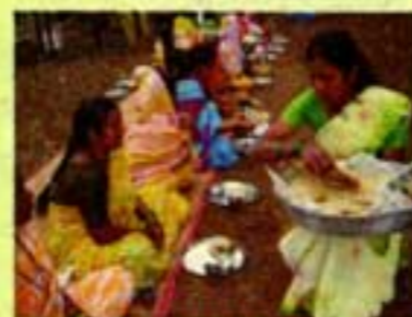
HOT BHAKARIS !!!

buildings which have been in disuse are being altered and adopted to make them suitable for training programmes. Facilities will be basic but of high