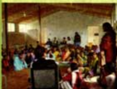
MEETING AT GRAMPARI

family, work, community and other situations. Initiatives of Change (lofC), formerly familiar as Moral Re-Armament (MRA) seeks to inspire people to become change agents in the society in the spirit: "be the change you want to see in the world". Grampari has started its operations by addressing the rural issues. The farm